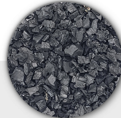
Pre-Mixed SBR Blends Rubber Mesh & Crumb Blends {2-1 mix} 8-12mm Crumb / 4- Mesh Blends