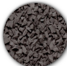
Middle Grey #055 [Thunder #7037]