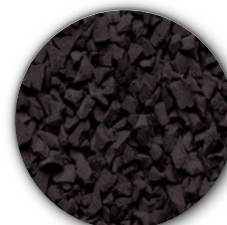
Dark Grey #045 [RAL #7011]

Please note; all colours are affected to varying degrees by colour shift through aromatic binder coating.