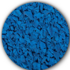
Capri Blue #024 [RAL #5019]