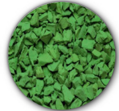
Bright Green #087 [Apple #6017]