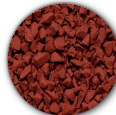
Red #062 [Rust #3016]