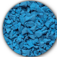
Bright Blue #084 [Arctic #5012]