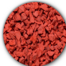
Bright Red #082 [RAL #3017]