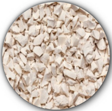
White #060 [RAL # 9010]