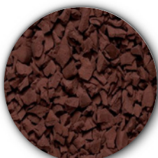
Brown #046 [Chocolate #8025]