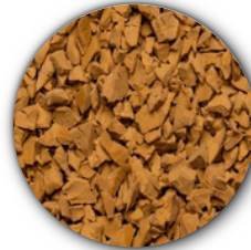
Yellow #069 [Desert Sand #1002]