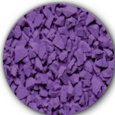
Lilac #044 [Lavender #4005]