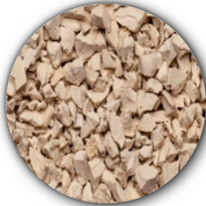
Eggshell #056 [Ivory #1015]