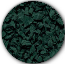
Dark Green #047 [Forest #6005]