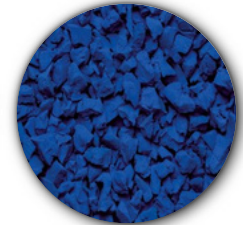
Dark Blue #054 [Navy Sea #5010]