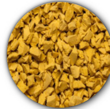
Bright Yellow #089 [Sunraysia #1012]