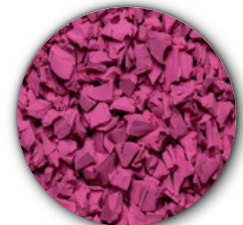
Pink #052 [RAL #4003]