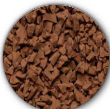
Beige Brown #076 [Mocha #8024]