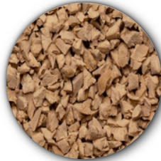
Beige #066 [Wheat # 1014]