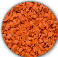
Bright Orange #083 [Uluru #2008]