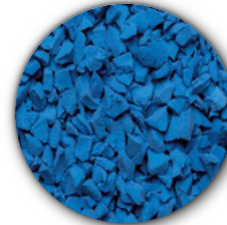
Blue #064 [Ocean #5015]