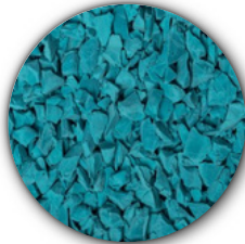
Turquoise Blue #134 [RAL #5018]