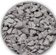
Grey #065 [Ash #7038]