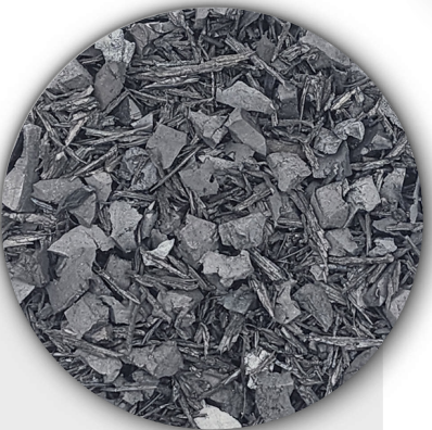
Rubber Mesh & Crumb Blends (8-12 Crumb / 4-Mesh Blends)