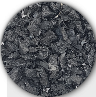
Base Rubber Crumb - (4-15, 8-12 and similar sizes*)