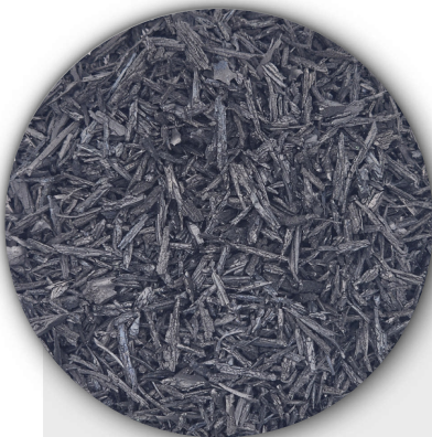
SBR Rubber Mesh (4 & 12 Mesh Varieties)